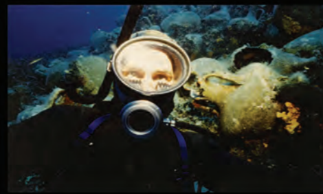
The author making the first dive to the classical wreck at Pethaménos, 1984.